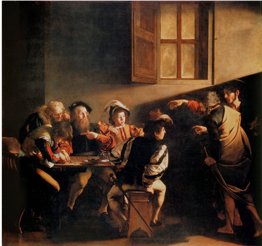
The Calling of St. Matthew – Caravaggio

St. Matthew's Episcopal Church 5900 7 th Avenue, Kenosha, Wisconsin 53140 262.654.8642 www.stmatthewskenosha.net